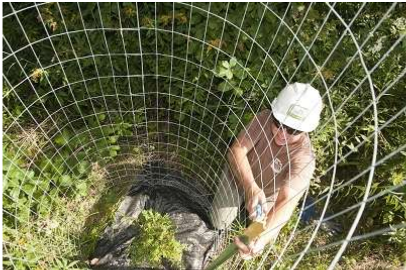
A Duluth Stream Corps worker adjusts deer fencing around a planted tree.

Community Action Duluth was recognized by the Minnesota Council of Nonprofits for two projects that employ innovative strategies designed to mobilize low-income people and communities. Community Action Duluth's Stream Corps Project works to restore the 42 streams that pass through Duluth on the way to Lake Superior. Through Stream Corps, Community Action Duluth is working to plant 20,000 trees that will stabilize 20 miles of stream bank over the next two years. Stream Corps employees and volunteers have also learned how to use Geographic Information Systems (GIS) software to integrate marketing, public outreach and forestry. The other program that received recognition was Seeds of Success, which hires individuals to grow vegetables in distressed lot locations throughout Duluth. Award-winners receive a professional video shoot about their projects and a small cash prize.